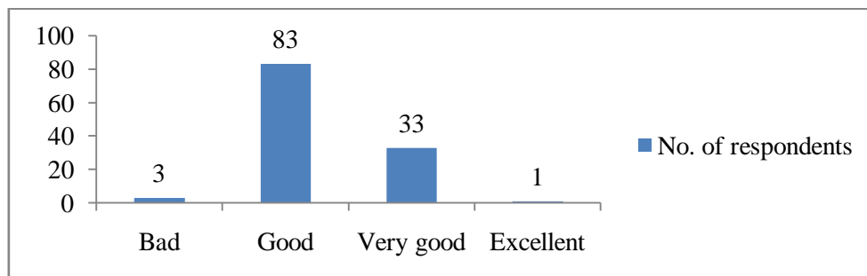
Fig- 2: Quality of services provided using the electronic justice system