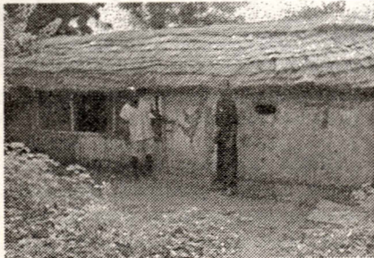
Fig. 2: Simple structure for animals using local materials

The churches involved have gained some form of popularity as a result of their intervention. None of the churches however supported the sector with the primary objective of attracting members to their churches.