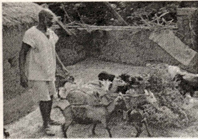
Fig. 1: Farmers practising dry season feeding using crop residue

pigs to cross with the local ones. Farmers also received financial support to construct pens and also carry out other farming activities.