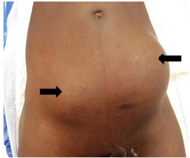
Figure 1. Bilateral spigelian hernia showing abdominal lumps

These findings are illustrated in Figure 2a, Figure 2b and Figure 2c. Complete blood count and renal function tests were essentially normal. A diagnosis of Incarcerated Bilateral Spigelian Hernia was made and the patient counseled for immediate operative intervention.