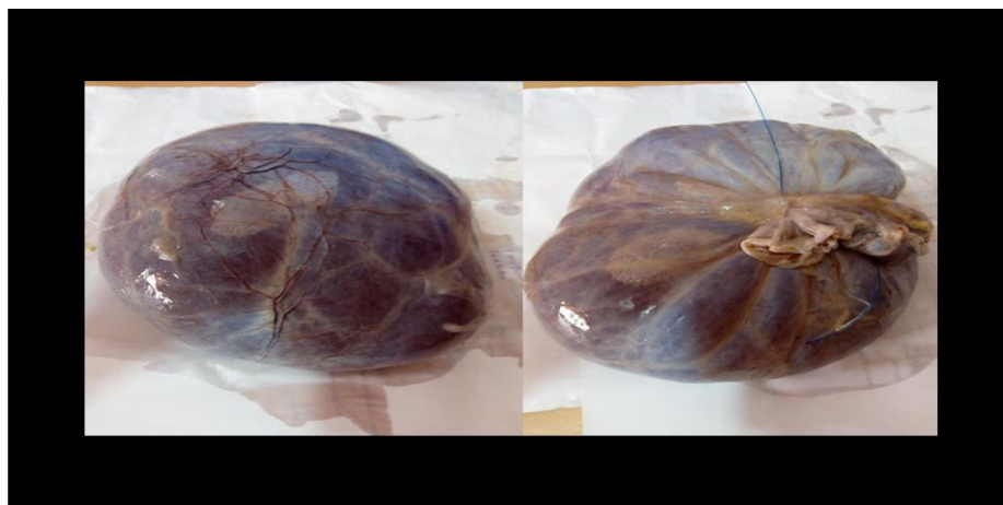
Figure 1: Resected cystic pancreatic mass in a 17-year old female at caeseran.

Grossly, the sample consisted of a huge resected cystic mass with an attached suture (Figure 1). Slicing through the mass reveals a unilocular cyst filled with deep straw coloured fluid, no palpable lesion seen. The wall was variably thickened. Microscopically, the cyst walls was fibrocollagenous and lined by ciliated pseudostratified columnar epithelium (respiratory epithelium) ( Figure 2 ). No malignancy seen Histopathological diagnosis: Pancreatic mass (Resection): True pancreatic cyst.