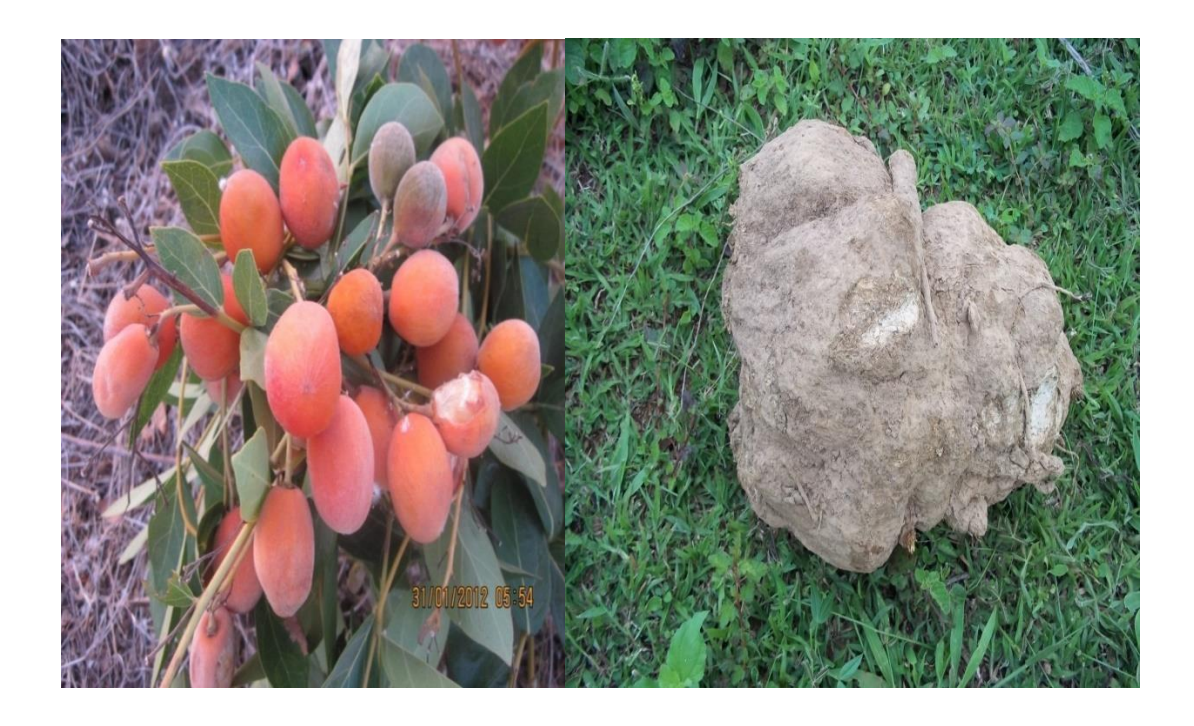
Plate 1: False yam plant with fruitsPlate 2: False yam tuber

Ibos, "Gbegbe" by the Yorubas (Asuzu and Abubakar, 1995) and "Efikison" by the Ibibios (Etukudo, 2003) in Nigeria.