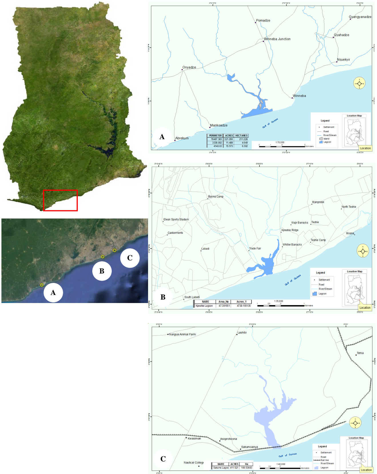
Figure 1. Map of the study area in Muni-Pomadze Lagoon (Winneba) (A), Kpeshie Lagoon (B), Sakumono Lagoon (C) and Ghana