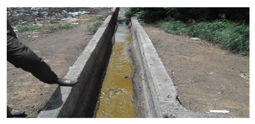
Figure 2. Drain carrying a mixture of blood and intestinal fluid.