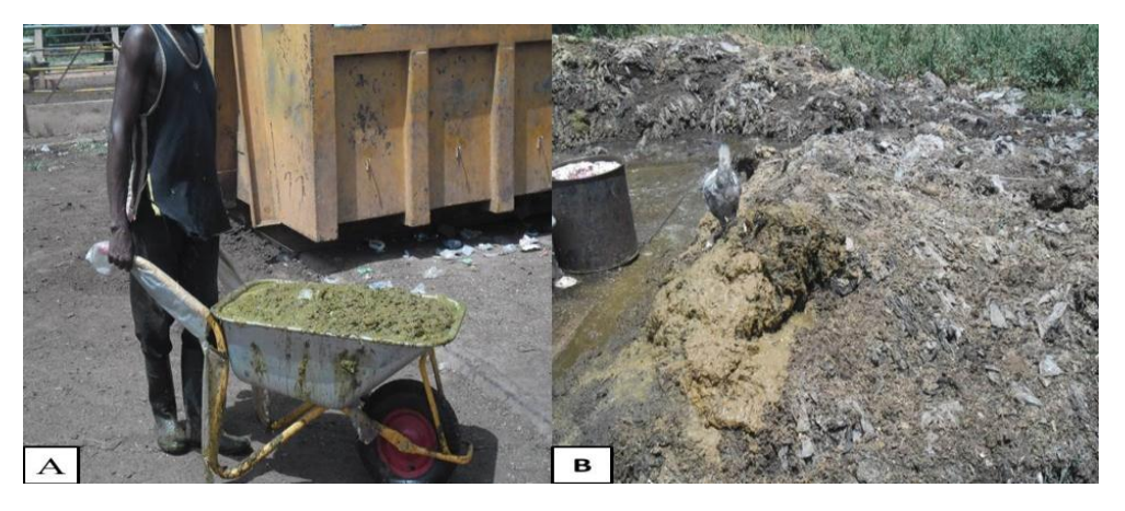
Figure 3. Abattoir assistant carting intestinal waste (A) to dumping site (B) close to abattoir.

intestinal contents are collected in wheelbarrows and deposited at designated points (Figure 3A and B).