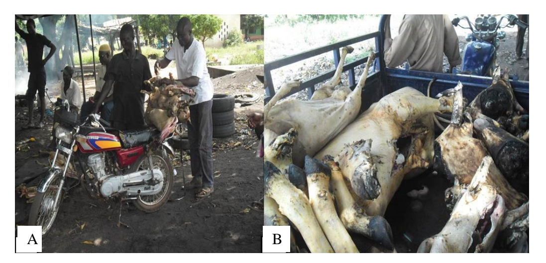
Figure 5. Images showing chevon (A) and Beef (B) ready to be transported to the market.

transportation to various retail centres within the municipality is also poor. But for the wrong approach to waste management, the volume of effluent generated at the abattoir is a potential resource that can be utilised to enhance operations as well as serve other sectors of the economy. For instance DeCo is a registered Ghanaian NGO that produce organic fertilizer for small-scale farmers (DeCo, 2011). It operates decentralized composting plants in the Northern region of Ghana using various kinds of biodegradable waste materials. Collaboration between the existing statutory regulatory bodies, municipal assemblies and major stakeholders (including DeCo) will help to address some of the pressing challenges of waste management at the abattoir. There is also the need for more robust monitoring and sanction regime (FDB, 2004) by the Veterinary Services as well as Food and Drugs Authority to ensure that meat processing and handling conform to the basic health and environmental standards.