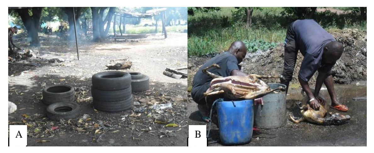
Figure 4. Open burning of fur with tyres and firewood (A). Carcass processing on the floor close to a pile of gut contents (B).

and 636.5 tons of waste tissues are discharged annually. This volume of waste when properly managed (composted or digested) will in addition to reducing the sanitation and health challenges round the facility, produce other benefits (for example, manure) for farmers and biogas for home and other uses. It has been estimated that 1 kg of fresh animal waste produce about 0.03 \text{ m}^3 of gas (methane) per day (FAO, 1996).