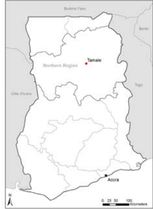
The Northern Region and its capital Tamale

To do this, eating patterns of twelve randomly selected households in urban, periurban and rural areas of Tamale were recorded. These food diaries consisted of the meals eaten by the individual households (either cooked at home or bought). The households were visited for a few days during the peak season of 2014 as well as the lean season of 2015. All foodstuff and ingredients were weighed and the food preparation processes recorded so as to depict the way such food is prepared in the region. To confirm the food preparation processes, the meals were cooked by members of the Department of Family and Consumer Sciences, University for Development Studies, Tamale, Ghana.