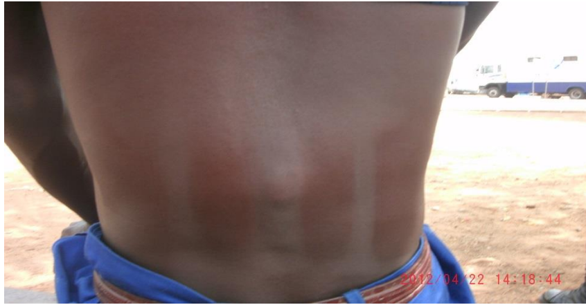
Pic 2: first stage of Potts disease/ patient could not walk.