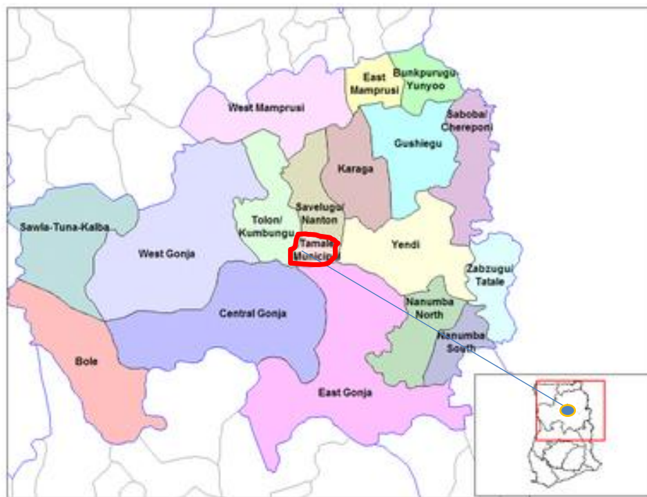
Figure 1. The Study Area

The Tamale Metropolis is the administrative capital of the Northern Region of Ghana. The Metropolis is located at the centre of the Northern Region. It shares common boundaries with Savelugu/Nanton District to the north, Tolon/ Kumbungu District to the west, Central Gonja District to the south-west, East Gonja District to the south and Yendi District to the east as shown in Figure 2. It occupies approximately 750 km sq. which is 13% of the total area of the Northern Region (Tamale Metropolitan Assembly Profile, 2006-2009). The Tamale Metropolis has a population of about 371,351 (GSS, 2010). Being the administrative capital of the region and an urban centre, there are several other ethnic groups and languages in the Metropolis. The dominant vegetation is woody savannah with some common tree species the shea trees, Dawadawa and Neem. A large section of the inhabitants are farmers, petty traders and civil servants. The Metropolis is located east of longitude 1° and between latitude 8°N and 11°. Tamale has uni-modal rainfall pattern with a mean annual rainfall of 1,100mm over 95 rainy days which begin later April to early May.