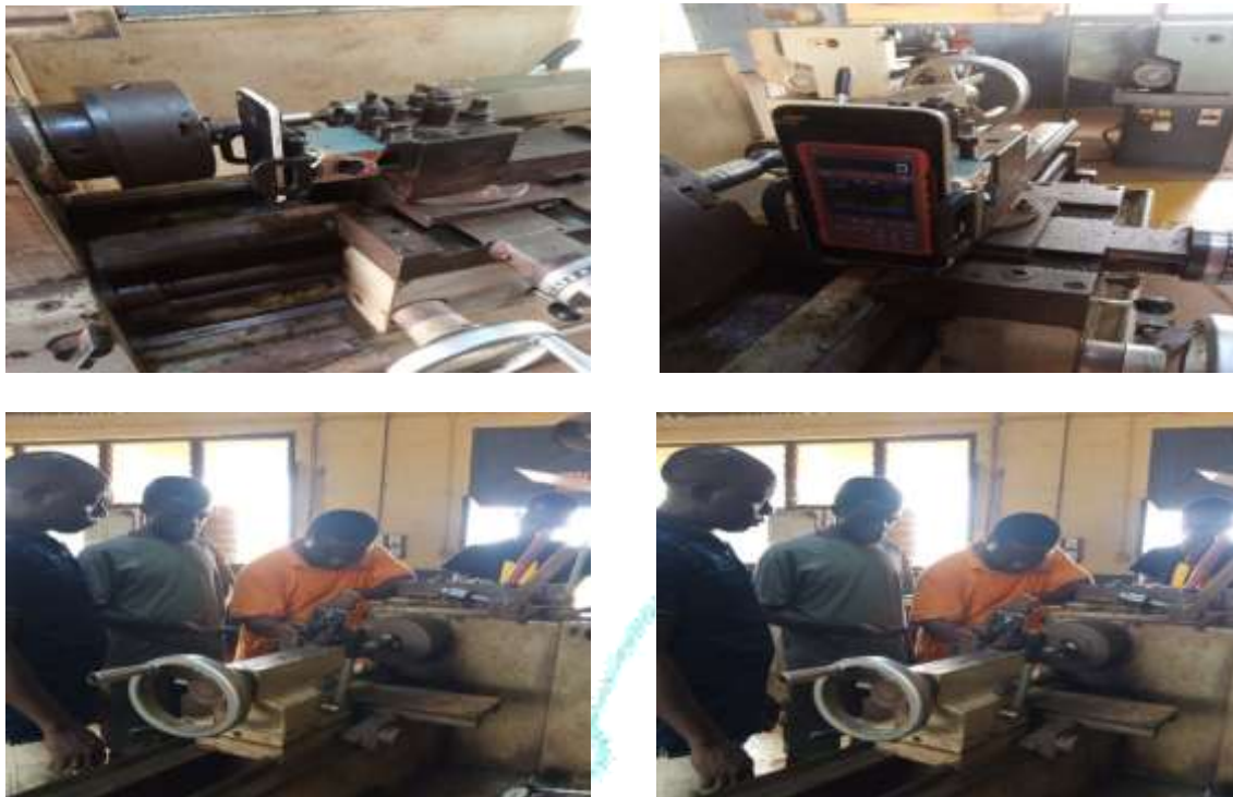
Figure 1: Experimental Setup