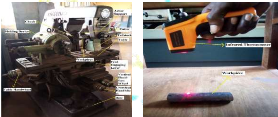
Figure 2: Experimental Set-up

After the face milling was done on the shafts, the temperatures were measured using an industrial infrared thermometer version 320-EN-00 7160320015 A0 with a range of -50°C to 400°C. The initial and final temperature of each workpiece was measured by pointing the laser on the workpiece. Figure 2 shows the experimental set-up