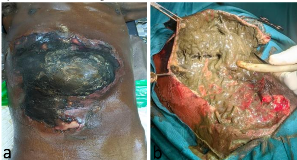
Figure 1: a) Necrotizing soft tissue infection of anterior abdominal wall, b) Surgical debridement of necrotic tissue showing fecal content.

Extensive debridement of skin, subcutaneous tissue and fascia was performed under general anesthesia. Intraoperative findings were dark necrotic skin of two thirds of the anterior abdominal wall. The fascial planes were thickened and destroyed in most parts. Within this plane was copious collection of fecal matter. There was midline epigastric fascial defect (2.5 x 2cm), about 6cm from xiphisternum. In the defect was a portion of the circumference of the transverse colon that had perforated (2 x 1cm) and had necrotic edges (Richter's type hernia). The omentum had formed a barrier to seal off the peritoneal cavity. Extensive debridement was performed and drainage of about 2L of fecal matter from the abdominal wall. After debridement, a controlled wound irrigation with saline prevent peritoneal contamination was performed. The surgical team rescrubbed and gowned and then performed an open laparotomy to explore the peritoneal cavity. The transverse colon was isolated and a transverse colectomy with end to end anastomosis was performed. The other peritoneal viscera were normal and there was no peritoneal soiling. Fascia was closed and epigastric defect repaired. Intraoperatively, the patient's blood pressure was sustained with inotropes. The patient had cardiac arrest on the table and despite appropriate resuscitative measures, he died. His family declined our request for autopsy.