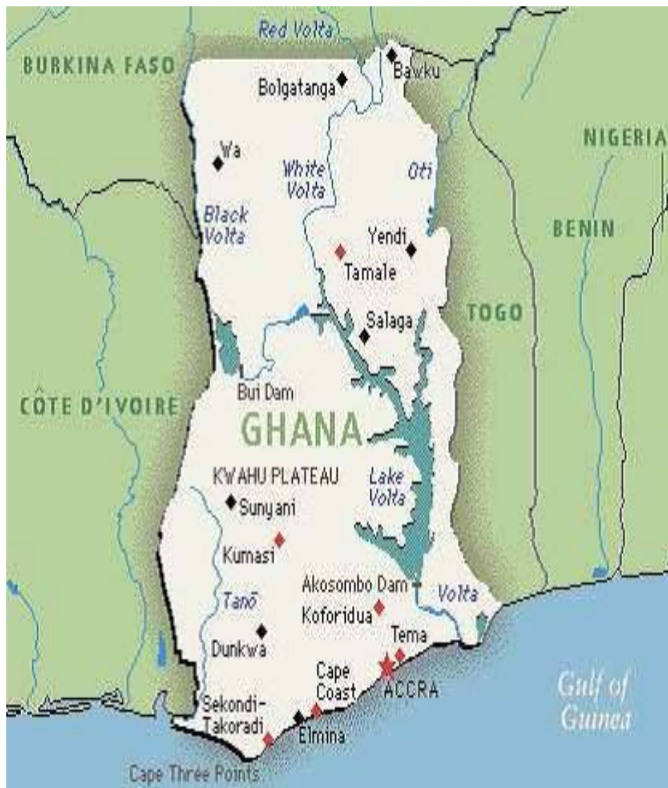
Figure 1. Map of Ghana.

Lower Heat Value (kJ/g) (LHV) is the net energy released on combustion.