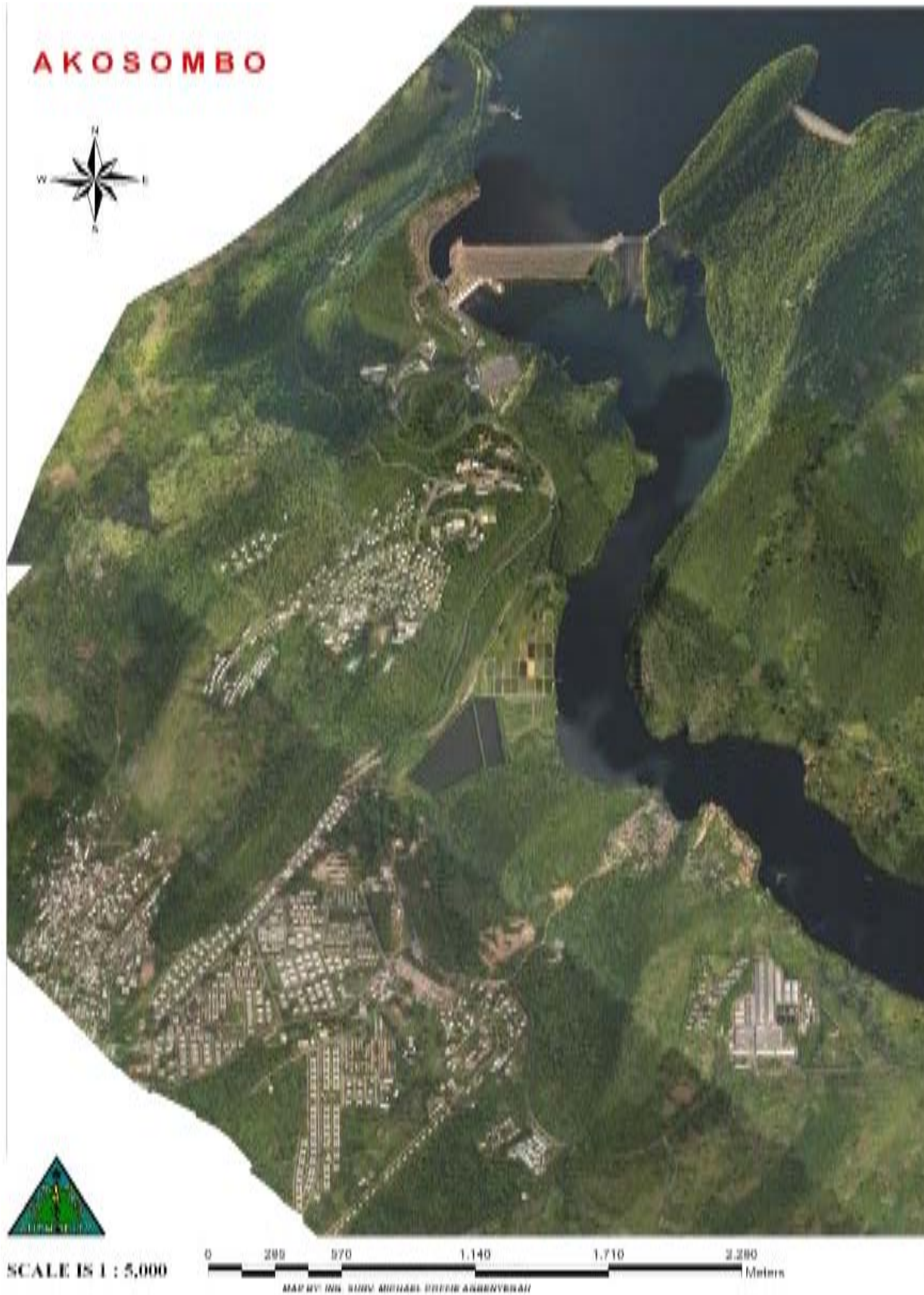
Figure 2. A Layout of Akosombo Township. Source of maps (Google Map Data, 2013).