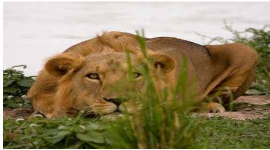
Plate 1. Hippos and Lions in KLNP