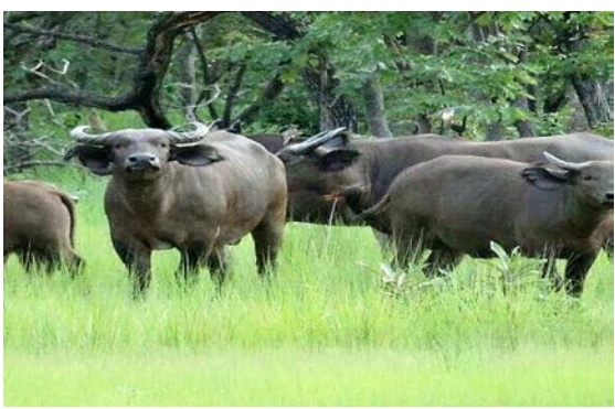
Plate 2. Elephants and Buffolos in MNP