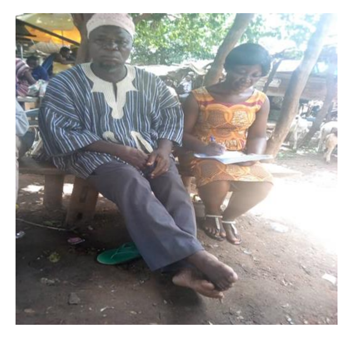
Plate 1: One of the farmers' being interviewed