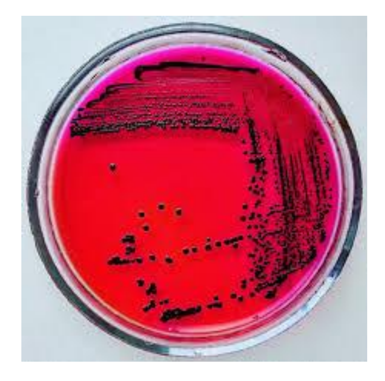
Plate 3: Salmonella on XLD