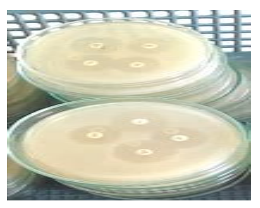
Plate 4: A picture showing antibiotic discs on plates with their inhibition zones

Using a sterile loop, 2-3 Salmonella colonies isolated from each other were picked and inoculated in a tube of trypticase soy broth and the turbidity of the inoculum was adjusted to 0.5 McFarland standards. Mueller-Hinton agar was inoculated by dipping a sterile cotton swab into the inoculum and swabbed completely on the surface of the agar plate. A sterile forceps was used to pick antibiotic disks which were placed on the inoculated agar plate and incubated at 37 °C for 18-24 hours (Bauer et al. , 1966). The results were interpreted following the guideline of Clinical and Laboratory Standards Institute (CLSI), (2008) as sensitive, intermediate, or resistant. All media, reagents and antibiotic disc used in this research were purchased from Oxoid, Basingstoke, UK.