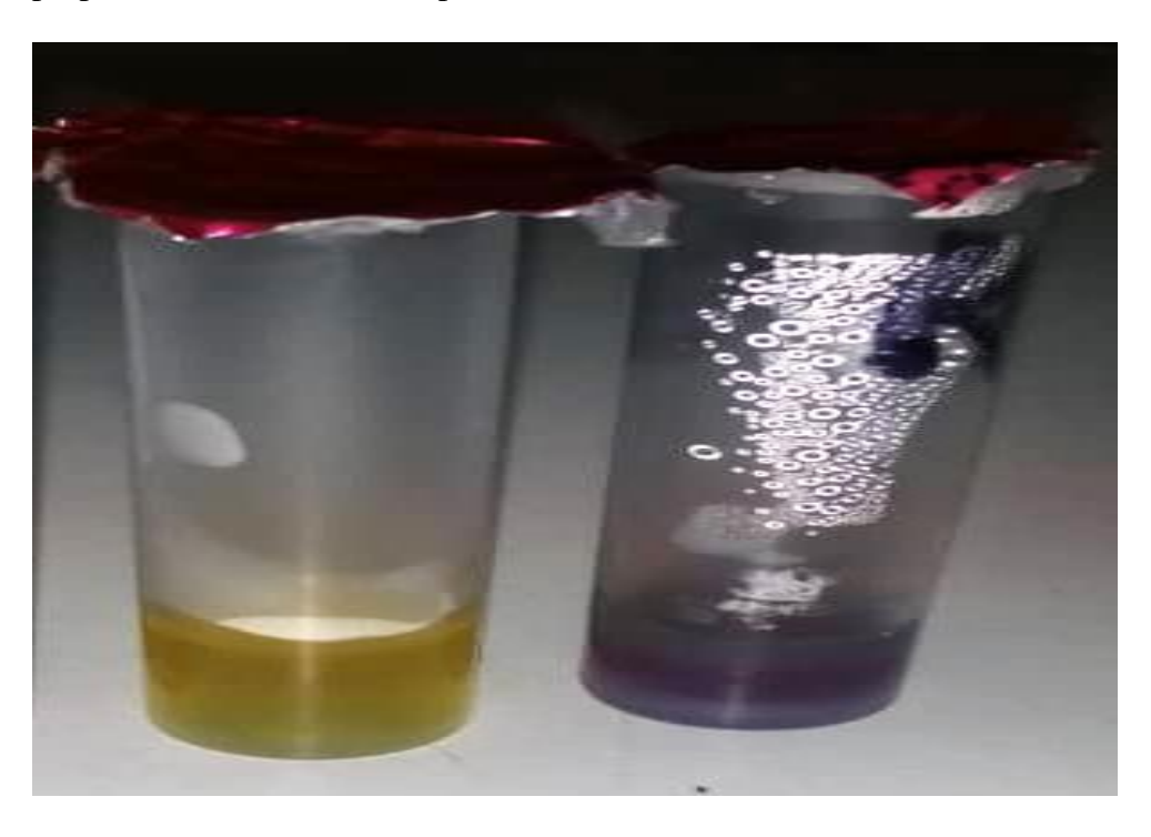
Plate 2: Premi®Test Kit Result

change in the negative control was observed within 4 hours. After the color of the negative control has changed, the results were read using color chart. If antibiotic residues are not in the extracted samples, the bacteria in the agar would grow and produce acids. This reduces it pH and causes the agar to change colour from purple to yellow and this is marked as negative. If antibiotics were inside the extracted sample, they would kill the bacteria in the agar or suppress it growth as a result, the entire or part of the agar in the tube remains purple and this is marked as positive for antibiotic residue.