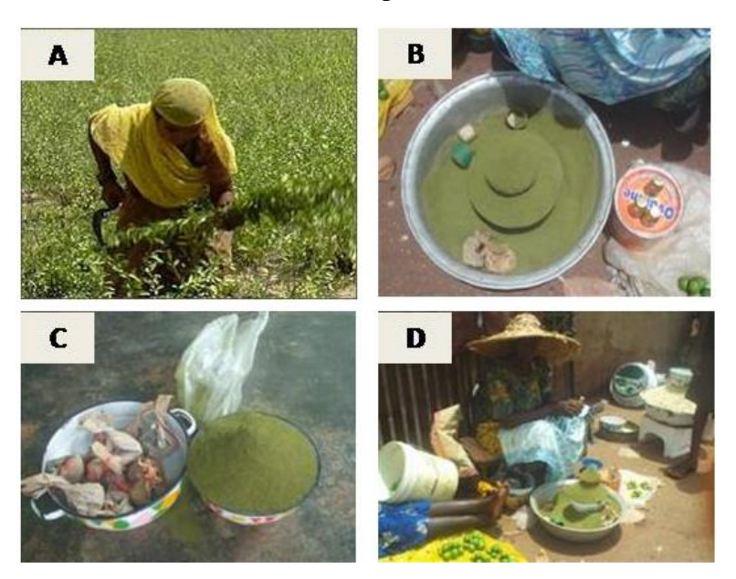
Figure 2. Pictures of henna production practice. A. Woman harvesting henna leaves B. Picture of Henna leaves powder after processing C. Packaged henna powder ready for sale D. Picture of a market woman engaged in the sale of henna powder.

pounding of the dried leaves and milling to obtain the green powder (Singh et al. , 2005). The extracted powder is then stored in polythene bags, jute sacks, plastic containers and stored in dried condition to prevent mould formation.