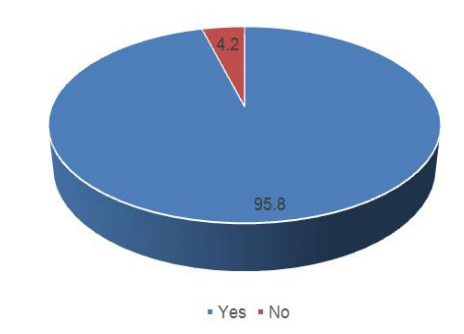
Fig. 2. Water accessibility by irrigation users

indicated water unavailability as a challenge to irrigation farming.