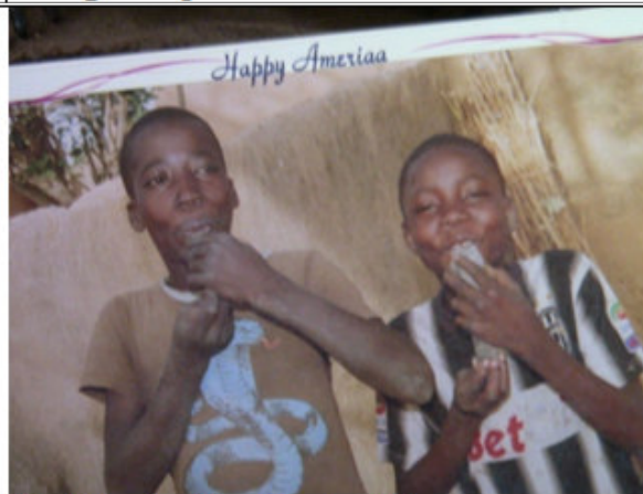
Youth having fun blowing Wia